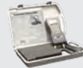
Programmable Refrigerant Charging Scale