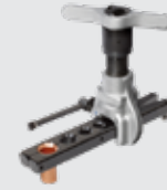
Ratchet Flaring Tool